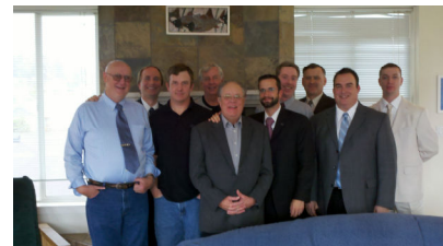
Priesthood members in attendance.