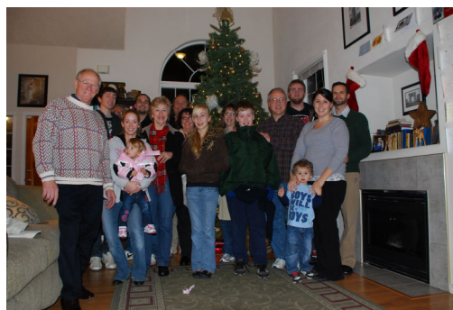
Left: Carolers that joined together last year.