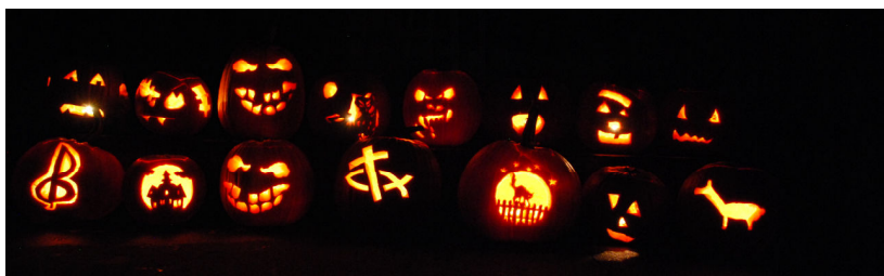
Pumpkins carved at the 2010 Harvest Party

A special thanks is owed to the Youth Commission for their diligent efforts in providing for and serving the youth in such a wonderful way.