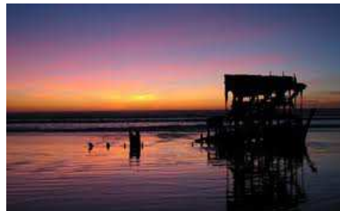
Fort Stevens State Park: 105 year old ship wreck

wildlife viewing platforms, and two fresh-water swimming areas on Lake Coffenbury. During the summer months, groups may enjoy a truck tour