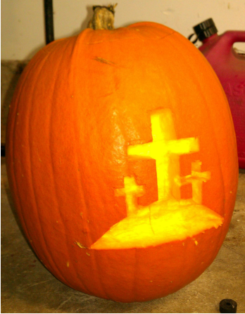
Three crosses pumpkin

Who said only children are allowed to play on the sea-saw, and run thru the pumpkins to find the prize winning, perfectly shaped and perfectly colored one? What is the purpose of gourds besides to make the holiday fun and decorative? Can you eat them? Who decided it is a good idea to create mystery bags containing food that is shaped and or feels like body parts and have people try to guess what is in them merely by touch? Well, I have no idea but it was so much fun! The youth met for the annual Harvest Party at 4pm on Saturday the 29th, then traveled to Bauman's Pumpkin Patch on a mission for fun. There, we found a wide variety of things to do as well as room to run and be free.