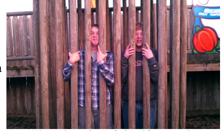
Two of our finest behind bars at the pumpkin patch

Pumpkin's and animals (some unexplainable as to what species they