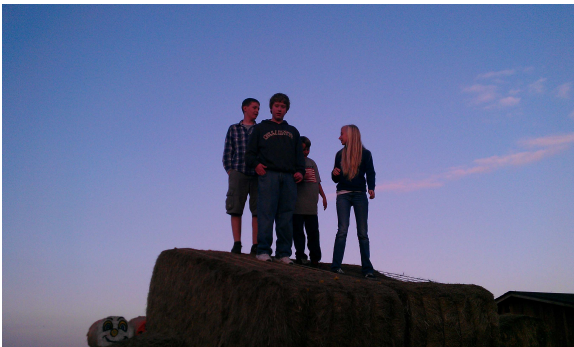
Several of the youth atop hay bales at the pumpkin patch

were claiming to be) were everywhere. The smell of open air was refreshing to one's soul. After spending some time enjoying the surroundings we headed back to continue our evening. Everyone cleaned and carved their masterpieces in preparation for display. During dinner we enjoyed the company and conversation of those present that we almost forgot to finish carving our pumpkins. Steve took everyone into the backyard one by one and allowed them to stick their hand into a bag of who knows what and try to