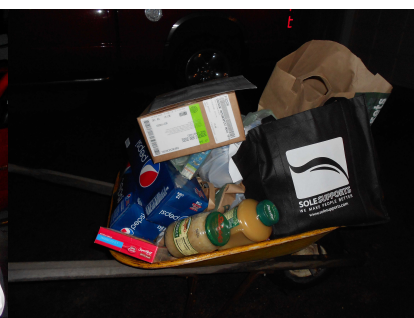
A wheelbarrow of food is collected