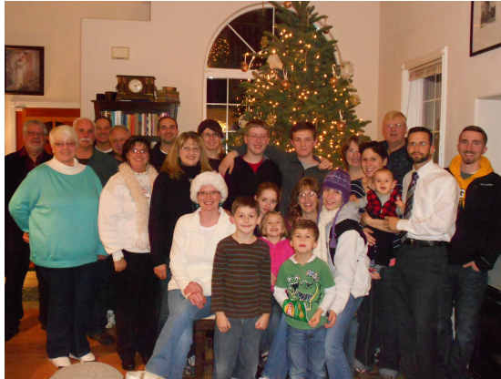
Some of the Saints gather to carol

On December 14, 2012, a number of the Saints gathered together to worship the Lord and herald the hope we find in our Savior by singing Christmas hymns. Twenty-four souls gathered together to praise the Lord, and collect non-perishable food items along the way, caroling from house to house. One-hundred and twenty-four pounds of food and cash donations were collected and given to the Marion Polk Food Share, a non-profit group helping to feed those in need within the community. It was a particularly solemn day, as the details of the horrendous act in Connecticut unfolded in measures in the media. Nevertheless, it seems the awful nature of those deeds would have only been compounded if the worship of the Saints had been muted, their tongues of praise silenced, or their message of hope gone unsung. They chose to gather and sing, despite heavy hearts, knowing well that the light of Christ was