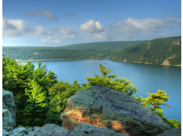
Devil's Lake, Lincoln City, Oregon