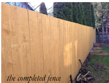
the completed fence