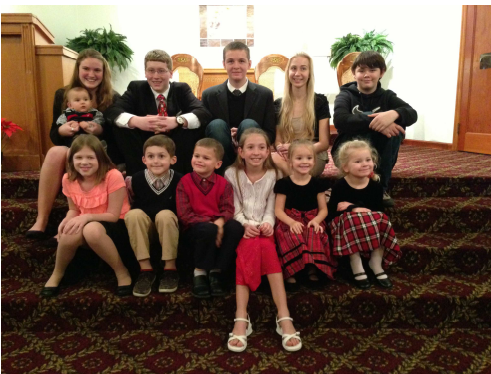
the younger Saints after the Christmas service