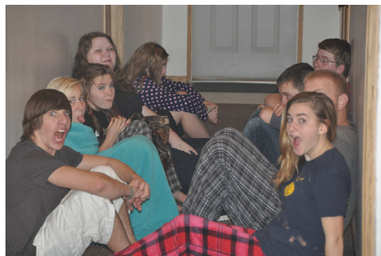
Some of the Youth at the Fall Retreat, 2012