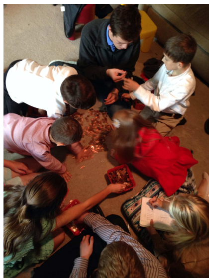
The youth count and present their offering