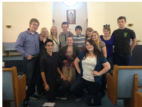
The youth group provides worship at Fall Conference

Dear Saints, In recent years I have witnessed the church grow. This growth has not just been in the number of bodies, but also in the hearts of the saints. The desire to serve the Lord has been increasing in our hearts and minds. I know that the youth have been growing closer to God and as a group also. During the 2013 youth camp the youth's friendship grew tremendously. We became of one heart and mind and strived to strengthen each other in our relationship with God. I am excited to be a part of the youth at this time in the church. I have heard in years past people saying that the youth are the future of the church and at that time I thought that was true. I now realize and I think other people have begun to realize that the youth are a part of the church now. I have felt a great desire in the youth to serve the Lord and do the best we can to serve the