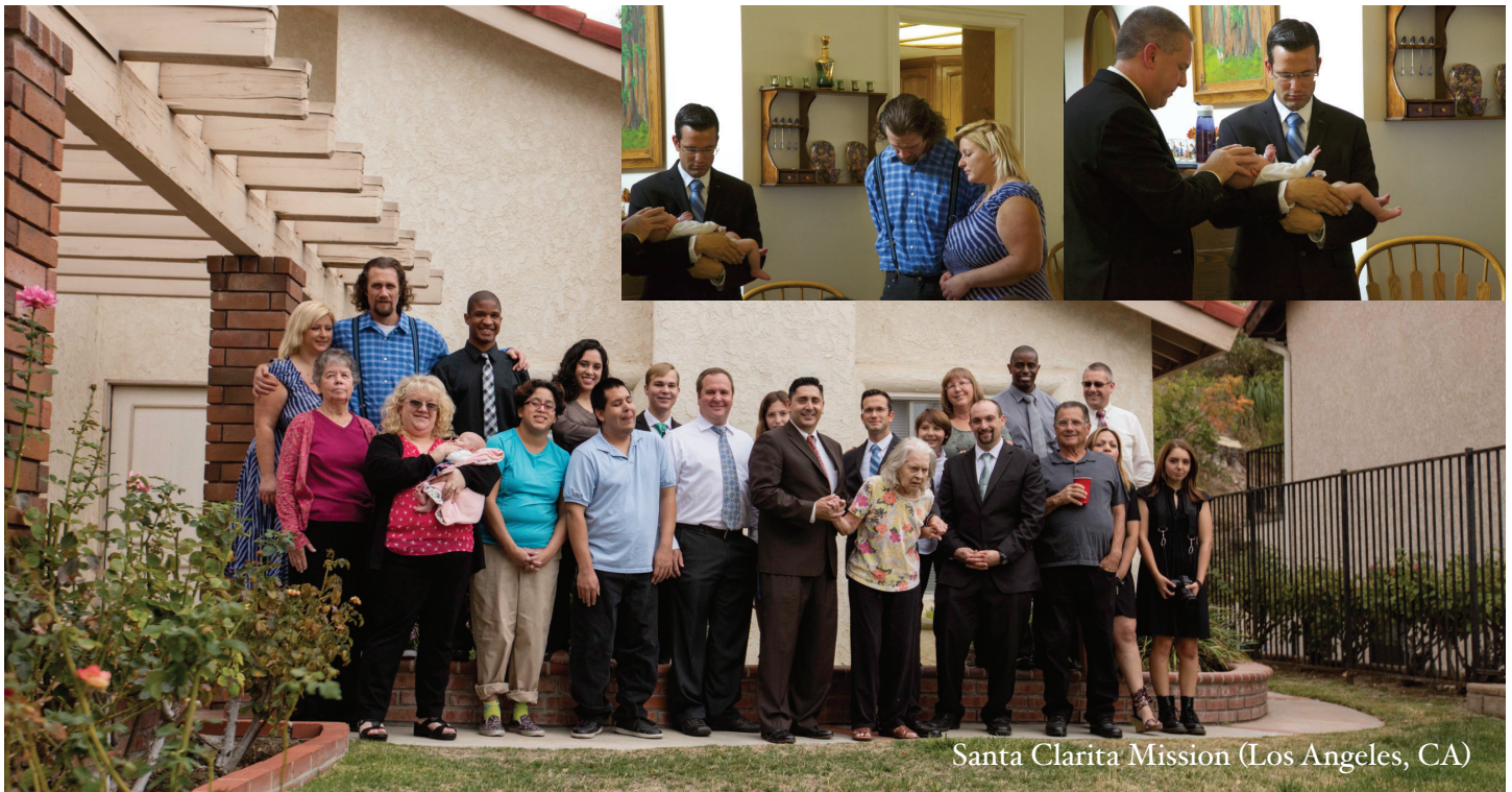
Santa Clarita Mission (Los Angeles, CA)