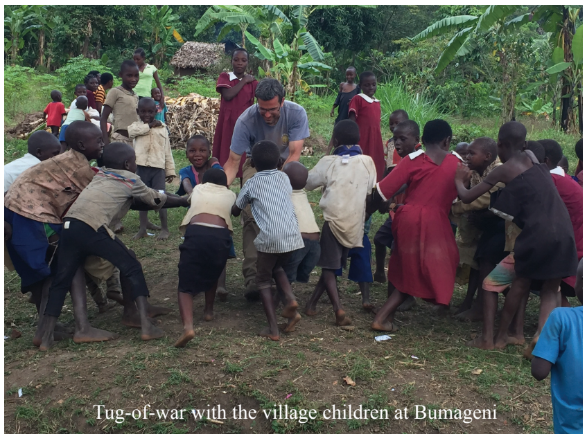
Tug-of-war with the village children at Bumageni