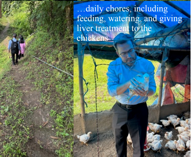
...daily chores, including feeding, watering, and giving liver treatment to the chickens